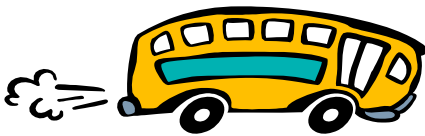
Bussing policy for Cold Weather days

If any bus route is cancelled in the morning it will not operate all day.