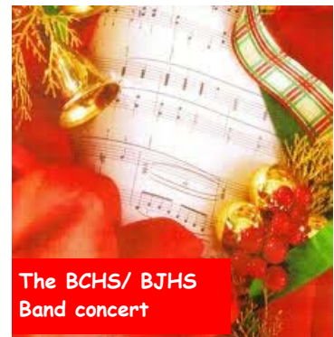
The BCHS/ BJHS Band concert

On December 12th - The BCHS and BJHS Band departments present their annual "Sounds of the Season" Christmas Concert. Bands from both schools will perform Christmas classics for the pleasure of the audience. Showtime is 7:00 at Griffin Park Theatre. Admission is $5 per person, $10 per family. Children 5 and under are free. Everybody is welcome to come and feel the Christmas spirit.